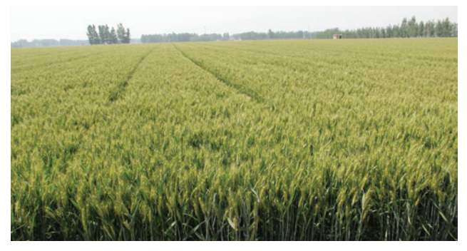
Wheat Mutant Variety Luyuan 502 which was developed by the Chinese Society of Nuclear Agricultural Sciences with IAEA support

China is home to 19 per cent of the world's population with only seven per cent of arable land to grow food. Food security therefore lies at the core of the country's socio-economic policymaking. Research on mutation breeding in wheat has focused on the improvement of desirable traits of the new crop species.